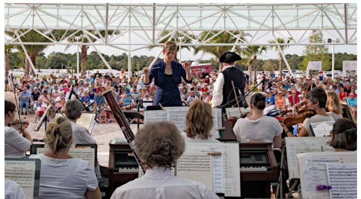
The POPS Orchestra of Bradenton and Sarasota and the Military Officers Association of Sarasota presented a Flag Day Celebration in 2015 and 2016.

Currently the Sarasota National Cemetery Advisory Committee plans and executes three events a year at Patriot Plaza. These events are to commemorate Memorial Day, Veterans Day and Wreaths Across America. Dignitaries, speakers, music, and veterans organizations participate and make each occasion one to remember. Community organizations continue to schedule special commemorations such as Flag Day, Patriots Day, and special tributes or concerts for the enjoyment of the public. We encourage each and every one of you to consider Patriot Plaza as a venue when you seek to honor veterans, inspire patriotism, and pass freedom on in our community. Follow this Link to learn how to plan an event at Patriot Plaza.