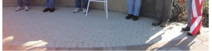
VIETNAM VETERANS DAY COMMEMORATION

During the school year, transportation funding is provided by The Patterson Foundation for students from the surrounding counties in grades 4-12 to visit Patriot Plaza, which is an EdExploreSRQ experience. This will ensure that our youth are able to learn more about patriotism, understand how we are able to enjoy the many freedoms we have in our country, and why we honor our veterans and their families.