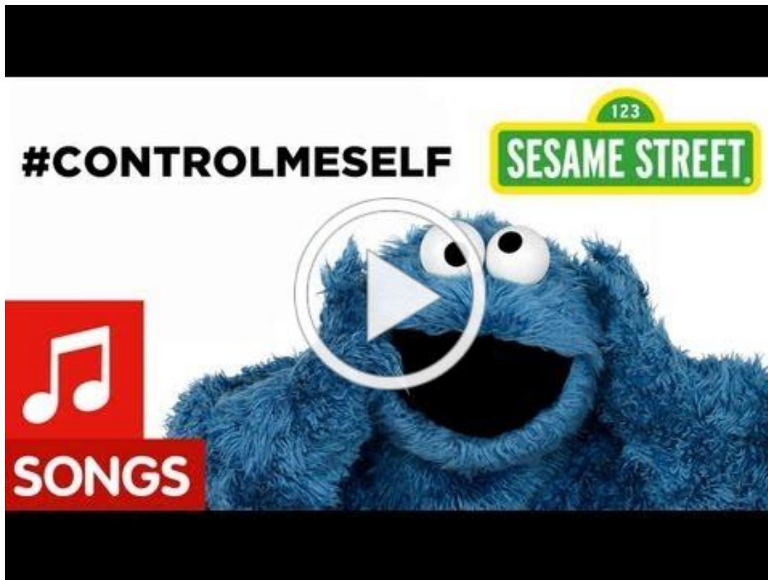
Sesame Street: Me Want It (But Me Wait) [total time: 3 minutes]

Do you know who else finally mastered self-control? After many, many years of impulsively devouring cookies, in 2012, Cookie Monster focused and reached his goal. Check it out!