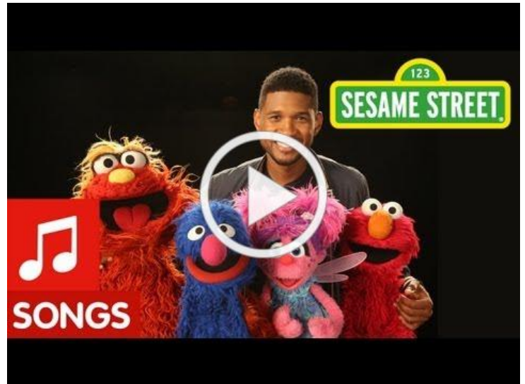
Usher's Alphabet Song [total time: 2 minutes]

6. Keep reading. Children of all ages, even those who are already reading themselves, benefit from cuddling up and listening to their parents read aloud.