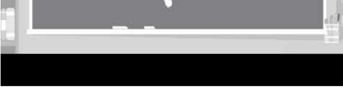
Teaching Letter Knowledge to Your Child [total time: 1 minute 30 seconds]