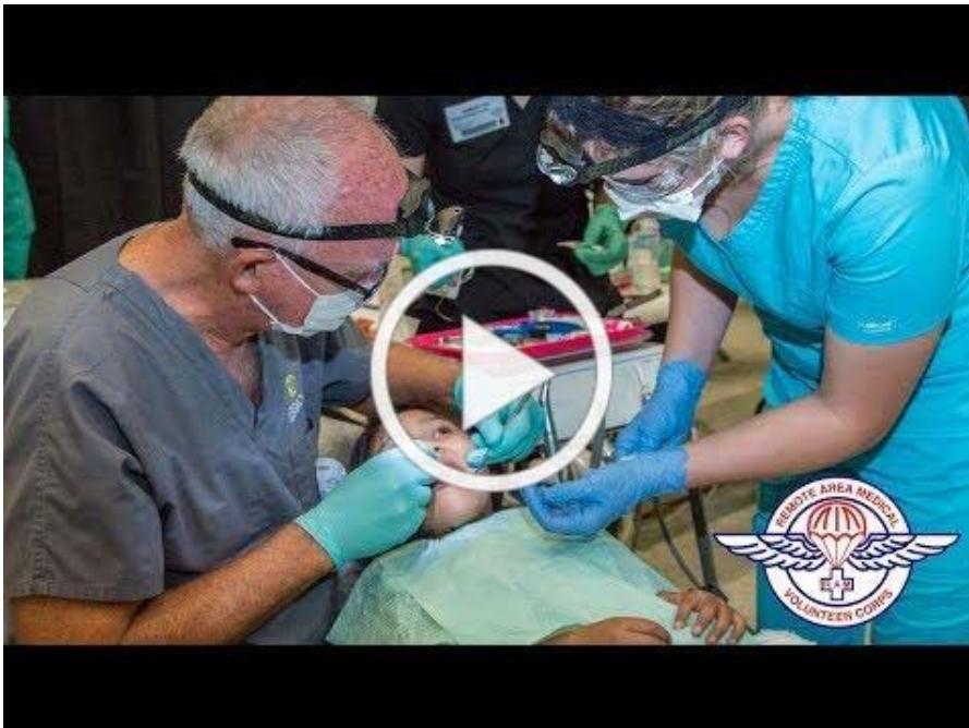
Remote Area Medical comes to Bradenton (3-min video)